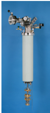
Wet DR 250 insert