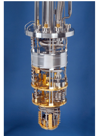
Wet DR 500 stage for UHV applications

© Copyright 2022 FormFactor, Inc. All rights reserved. FormFactor and the FormFactor logo are trademarks of FormFactor, Inc. All other trademarks are the property of their respective owners.