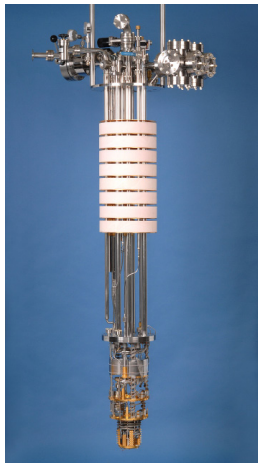
Wet DR 500-TL insert for STM