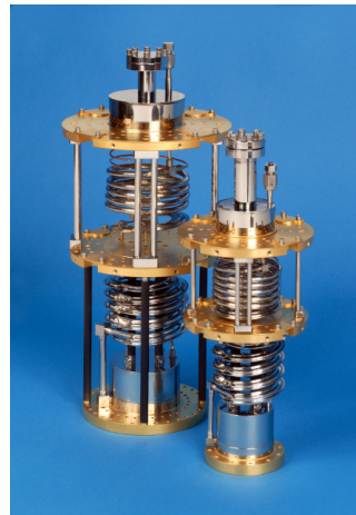
Side by side comparison of Wet DR 250 and Wet DR 500 dilution refrigerator stages